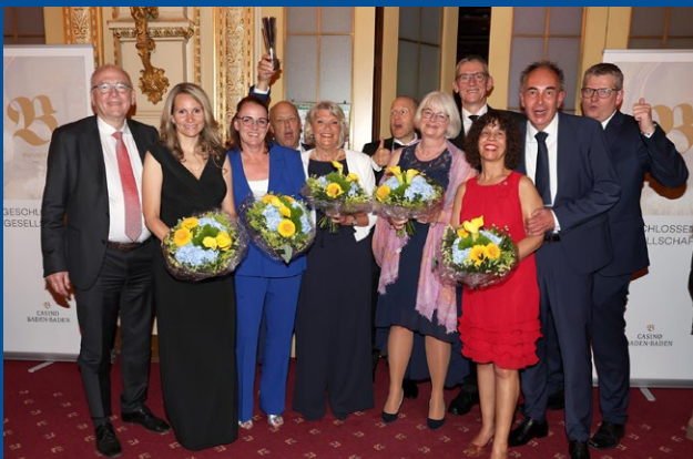
CHAMPION OWNER 2023 LIBERTY RACING 2021