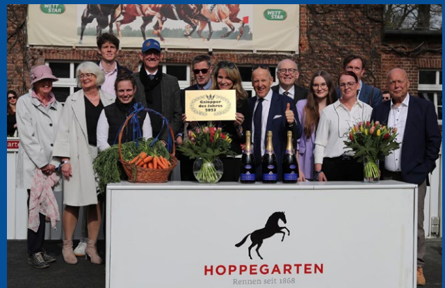
HORSE OF THE YEAR 2023 FANTASTIC MOON