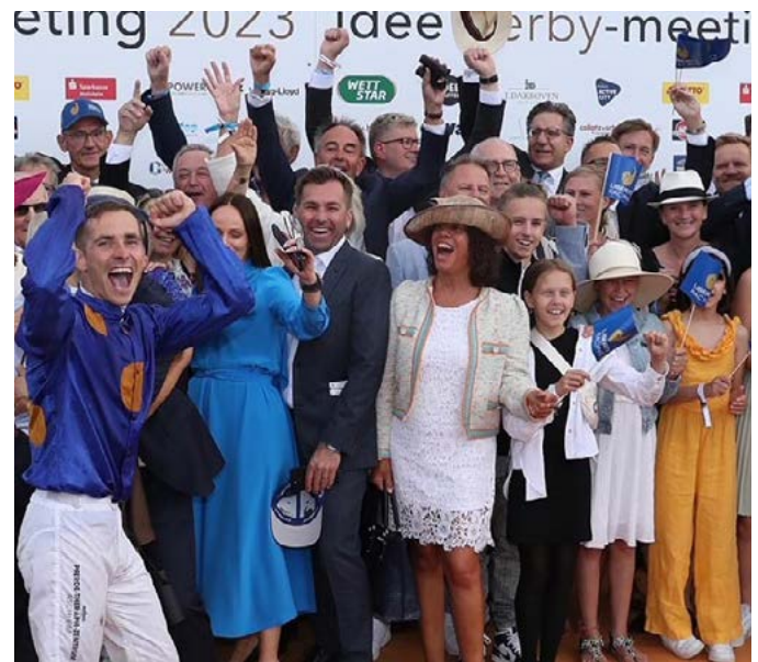
Liberty members celebrate their Gr.1 Deutsches Derby triumph at Hamburg.