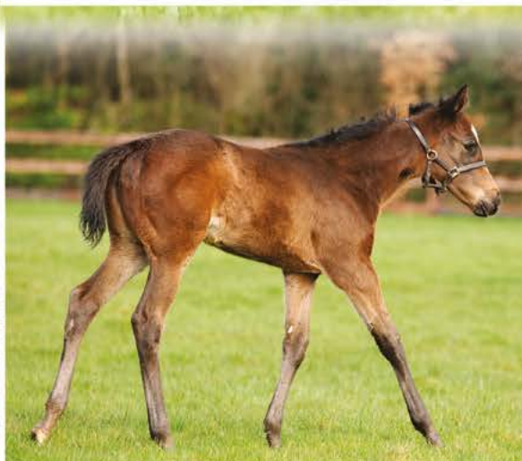
Filly ex Sablonne