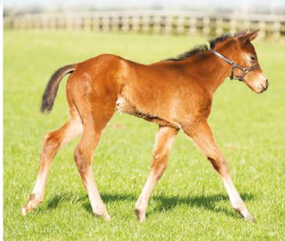
Colt ex East Of Eden