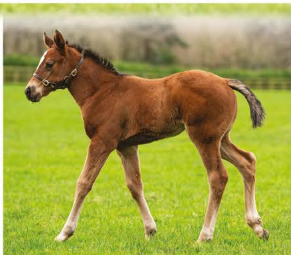
Filly ex Arabic Charm