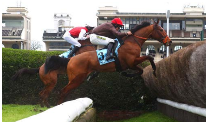
Young chaser Juntos Ganamos (Martaline) landed the Gr.3 Prix Troytown at Auteuil yesterday.