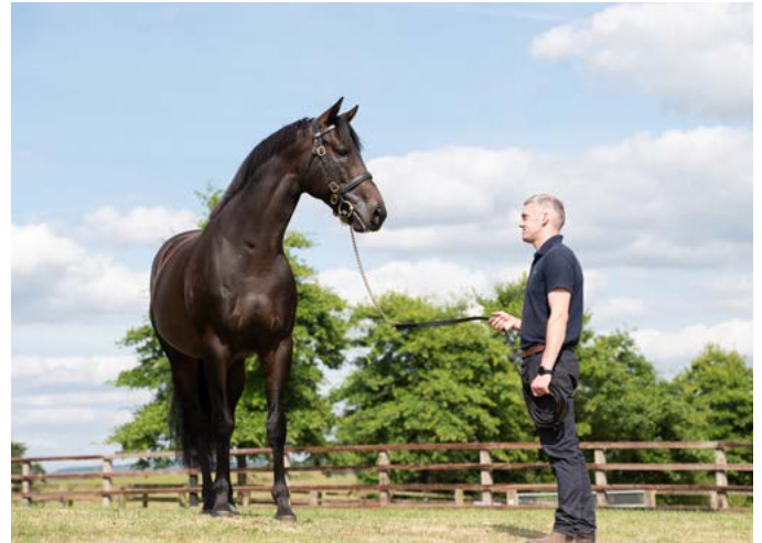
Castlehyde Stud's Arizona is one of four first-season sires to have their first runner in the 5f Irish EBF maiden at the Curragh this afternoon.