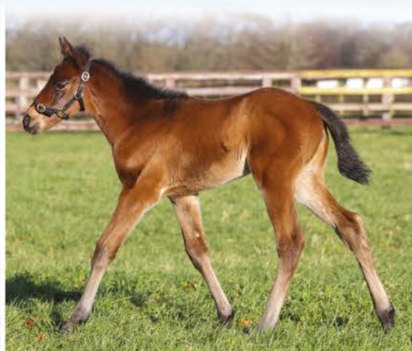
Filly ex Carmen