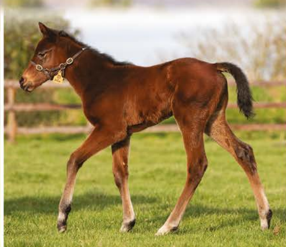
Filly ex Alfea