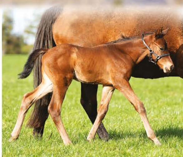
Colt ex Dancing on Air